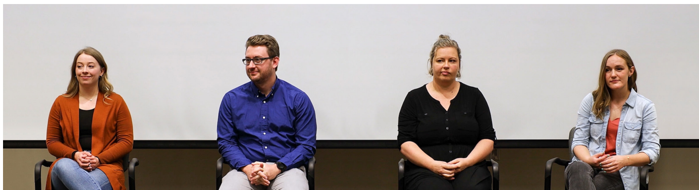
English at Work panelists share their career journeys with an English degree.