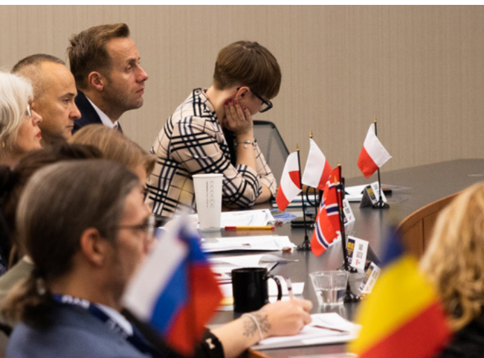
NATO representatives highlight the importance of language learning at BILC Conference.