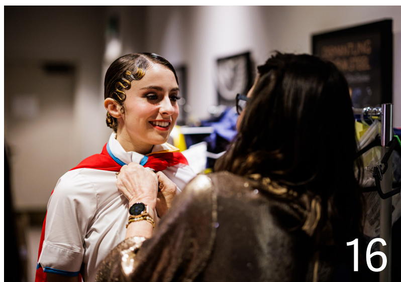
(LEFT)